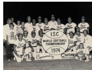
1974 Sun City Page Raiders