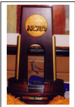
National Championship Trophy