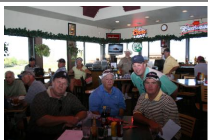
Fletcher Team Win Mens' Division Again

Included in this mailing is the flyer for our fall tournament at Aguila Golf Course in Phoenix on September 20 th with a shot gun start at 7:30.