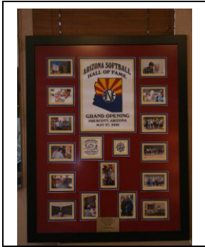
Photographic display of opening ceremonies

The Softball Foundation would like to thank the following people for their memorabilia contributions to the Hall of Fame.