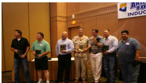
Members of the 1994 Advocate Fast Pitch Team in attendance.

Over a hundred sixty people attended this year's induction banquet at the Sheraton Crescent Hotel. Three contributors and one player were inducted at this year's banquet. Also, the 1994 Advocate Men's Fast Pitch Team was honored for their many accomplishments including the 1996 North American Fast Pitch Association National Championship.