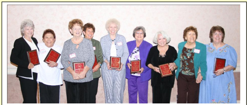
The Glendale Sweethearts