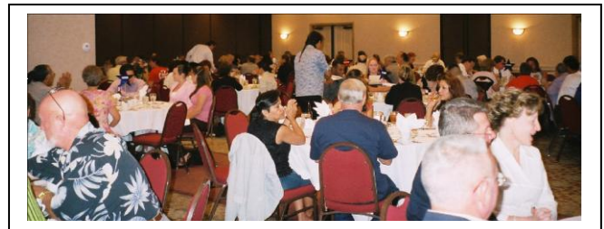
2004 Hall of Fame Induction Banquet